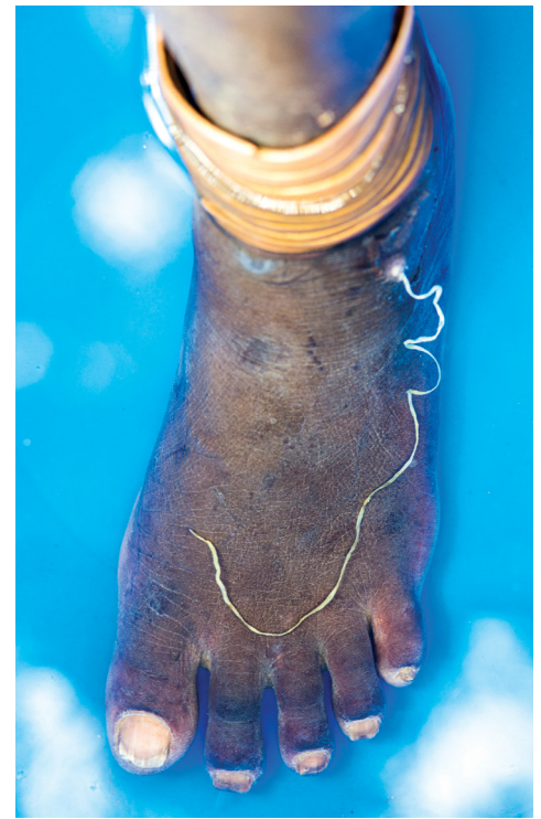
Long and threadlike, Guinea worms often appear in a person's legs and feet.

Eradication can be certified only when surveillance can be carried out in all areas to show transmission has been interrupted in humans and animals. Parts of some affected countries are inaccessible to the program because of internal armed conflict. Resolution of these conflicts is key to eradication.