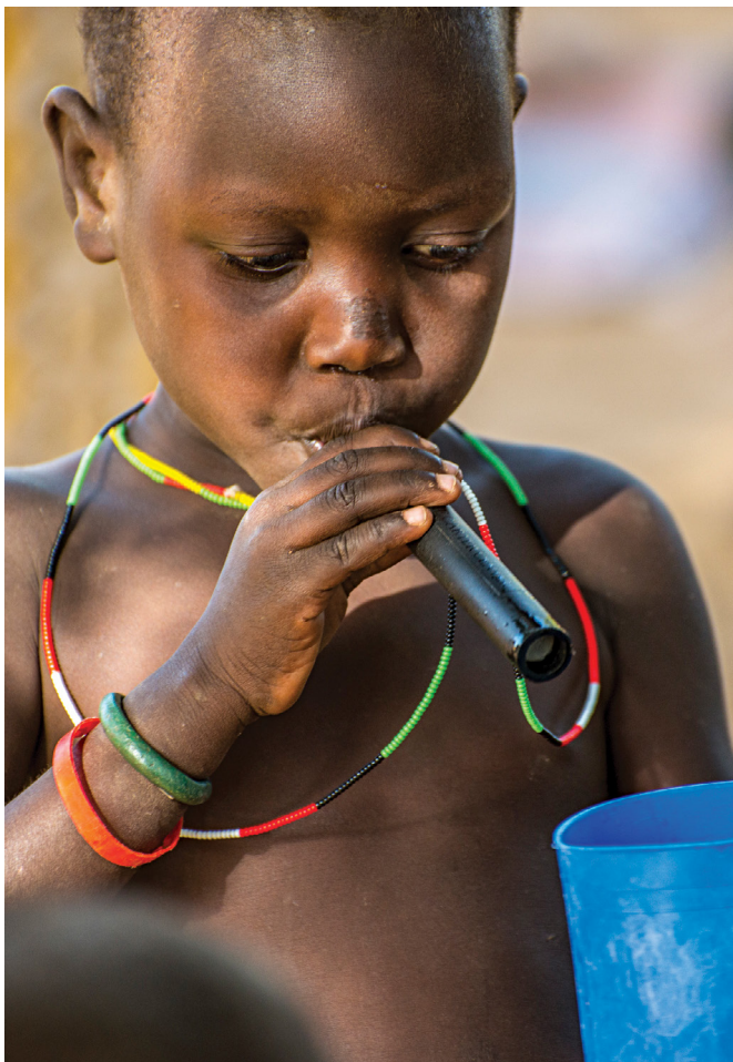
A South Sudanese child practices using a pipe water filter.

In 1986, the disease afflicted an estimated 3.5 million people a year in 21 countries in Africa and Asia. Today, the incidence of Guinea worm has been reduced by more than 99.99% to just 27 cases in 2020 in remote locations in six countries: Angola, Cameroon, Chad, Ethiopia, Mali, and South Sudan. Additionally, 2,001 infections in animals—mainly domestic dogs in Chad—were reported in 2020.